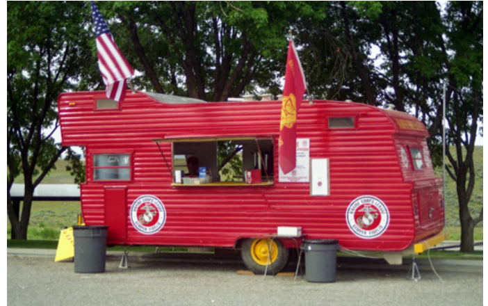
Coffee Wagon on location at Blacks Creek rest-stop